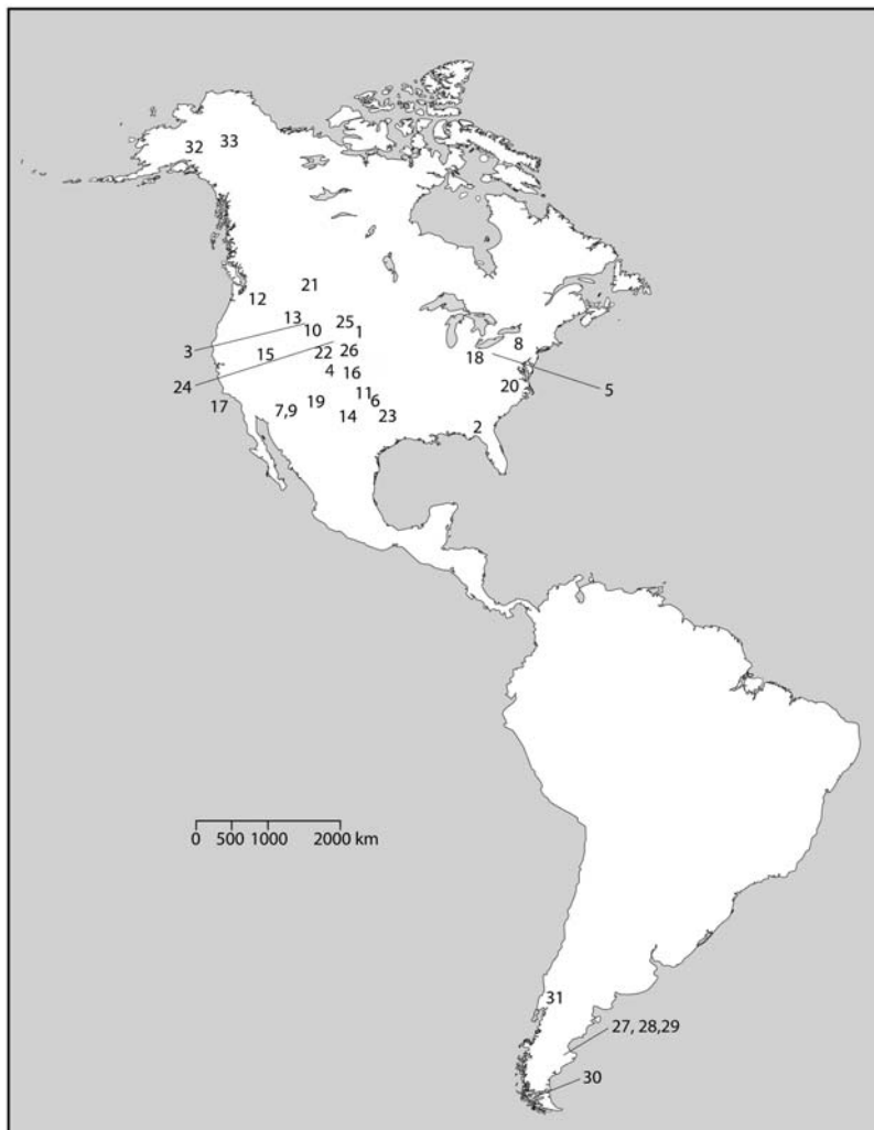
Fig. 1. Map showing the location of Clovis and other early sites. The numbers correspond to those found in Table 1. Other sites are 31, Monte Verde, Chile; 32, Nenana Complex sites, Alaska; and 33, Broken Mammoth, Alaska.

These 43 ^{14}\text{C} dates place the beginning of Clovis at \sim 11,050 ^{14}\text{C} yr B.P. (reducing former estimates by 450 ^{14}\text{C} years) and its end at \sim 10,800 ^{14}\text{C} yr B.P. (younger than previous estimates by 100 ^{14}\text{C} years). Accurate calendar correlation of ^{14}\text{C} ages from the Clovis time period is not currently possible because of correlation uncertainties (9). The Clovis-period segment of the INTCAL04 calibration is based on ^{14}\text{C} -dated marine foraminifera and is not accurate for the Clovis time period (10). The most accurate calibration for this time period is provided by a floating European tree-ring chronology that is provisionally anchored to INTCAL04 (11). Using this tentative calibration (11), we estimated that Clovis has a maximum possible date range of 13,250 to 12,800 calendar yr B.P.—a span of 450 calendar years (Fig. 2). By taking the youngest possible calibrated age for the oldest Clovis site and the oldest possible calibrated age for the youngest Clovis site, a minimum range for Clovis is calculated as 13,125 to 12,925 calendar yr B.P.—a span of