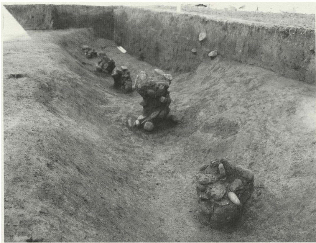
Figure 4. Rock-filled postholes at the base of the top zone of ditch fill in Enclosure No. 1.

uments common in the Ohio Valley called small geometric enclosures. Sometimes referred to as the Mt. Horeb tradition (Byers 2004; DeBoer 1997) or Adena sacred circles (Webb and Snow 1945), these earthworks are much smaller than massive ditches and embankments that serve to demarcate monumental sites around the Scioto-Paint Creek confluence, and as a result, they have likely suffered far greater effects from erosion and plowing. Nevertheless, they are noted with some frequency on early maps of the greater Ohio Valley (e.g., Squier and Davis 1998 [1848]), both in association with and away from larger earthwork complexes. Though historically associated with the Early Woodland period and the Adena complex, 2 “It is now recognized that the Mt. Horeb tradition not only largely defines the later Early Woodland period but also extends into the Middle Woodland in limited parts of this region [the Central Ohio Valley], terminating around AD 250” (Byers 2004:28–29).