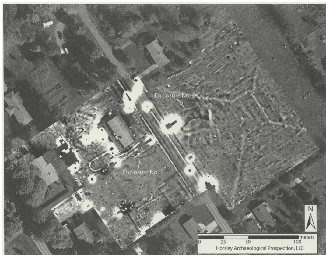
Figure 2. Extract of the Garden Creek magnetometer data revealing anomalies representing Enclosures No. 1 and No. 2. Other archaeological features are also suggested, as well as disturbances associated with modern features (e.g., iron metal, septic systems), and agricultural activities (plow scars). Results are plotted from -12 nT (white) to +12 nT (black). Processing was limited to clipping to within 30 nT, application of zero mean traverse, and interpolation to a resolution of .25 m x .125 m.

In short, old and new fieldwork at Garden Creek has generated a record of monumentality and material culture that points to similarities and, by extension, interaction with Hopewellian peoples in the Midwest. By examining these monuments and their associated assemblages in more detail, I argue that it is possible to delineate not simply participation in so-called Middle Woodland interaction spheres, but more specifically the intensity, directionality, and temporality of local communities' relationships with foreign people and places.